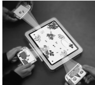
figure 1. Illustration of the MUSHI system in use.

Interfaces --- Collaborative computing, Synchronous interaction, 16.8 [Simulation and Modeling]: Types of Simulation --- Animation, Continuous, Distributed, Gaming