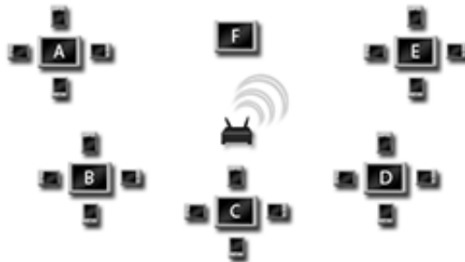
Figure 3. A schematic depicting the use of the MUSHI framework in a classroom of 20 students. The students each have a handheld computer and are divided into five groups of four, labeled A-E. The remaining tablet or desktop PC, F, is reserved for the instructor’s use.

Handhelds are provided to each student and are used as “microscopes” to inspect the creatures or their environment in a high level of detail (see Figure 2, second and third images). The simultaneous presentation of the overarching ecosystem (via the tablet screen) and a “bugs-eye-view” on the student’s handheld challenges the student to (1) make connections between the different levels of granularity in a complex system. An inquiry-learning based curriculum constructed around the MUSHI-Life simulation takes students through different stages of the inquiry learning process: observation, interpretation, prediction, and experimentation. Because the simulation is rule-based, many different lessons can be taught merely by adjusting the simulation parameters.