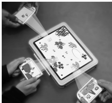
Figure 1. In this illustration, three students are depicted inspecting regions of the MUSHI simulation. The simulation, running on a tablet PC, wirelessly delivers content to their handhelds.

Many scientific phenomena are complex, emergent systems: systems wherein many small, individual items (like atoms and ants) operate according to simple rule sets, and the interactions of these items result in the emergence of larger, complex patterns (like crystallization and ant colonies). Because these complex systems operate at different levels of scale, one must understand how these different levels interrelate to truly comprehend the phenomenon. It is this learning challenge that we are tackling with the design of MUSHI (Multi-User Simulation with Handheld Integration). We endeavor to create a learning environment, grounded in both cognitive and social theories of learning, which fuses inquiry tasks and emerging technology into a unique framework (Figure 1).