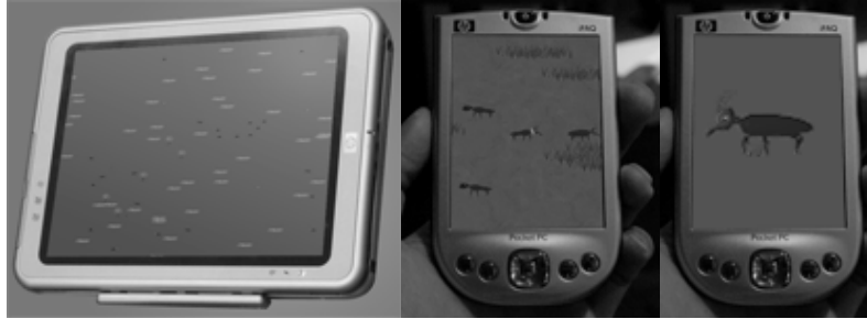
Figure 2. Image of MUSHI-Life simulation running on a tablet PC and on a handheld.

The MUSHI framework was designed to take advantage of the collaborative and individual agency benefits of handheld-based participatory simulations while incorporating anchors, MLRs, and collaboration-inducing tasks. Part of the framework is a tangible architecture (which wirelessly links handhelds to tablet PCs) and part is learning environment design (with particular attention paid to the simulation, inquiry learning tasks, and participation structures). An explanation of the framework is best done in the context of an example: MUSHI-Life.